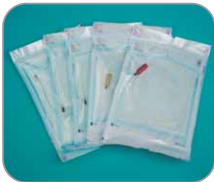
Optical fibres from 200 \mu\text{m} to 1000 \mu\text{m}

Smart 1064 DW with double wavelengths (1064 nm and 1320 nm) offering increased coagulative and ablative capacities. The systems are entirely stand-alone without any external water connections.